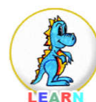
Richmond Primary School