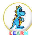
Richmond Primary School